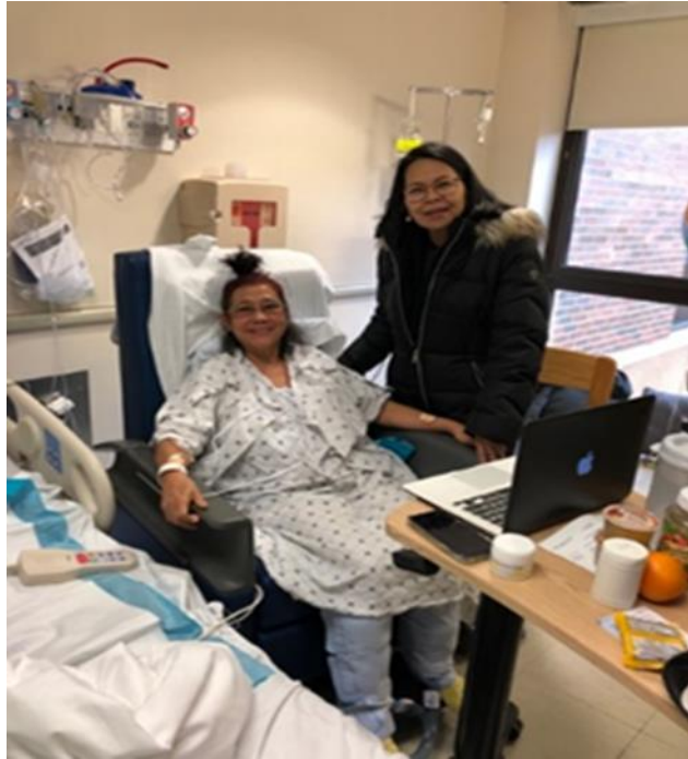
OWWA Chief Assures OFWs of Continued Assistance Amidst Pandemic