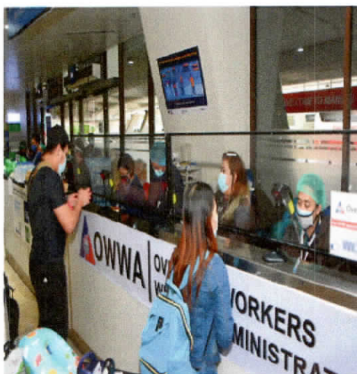
OWWA Chief Assures OFWs of Continued Assistance Amidst Pandemic